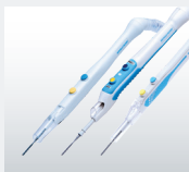
VISICLEAR® SMOKE EVACUATOR