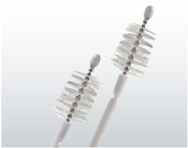
ROUNDED BRUSH TIP