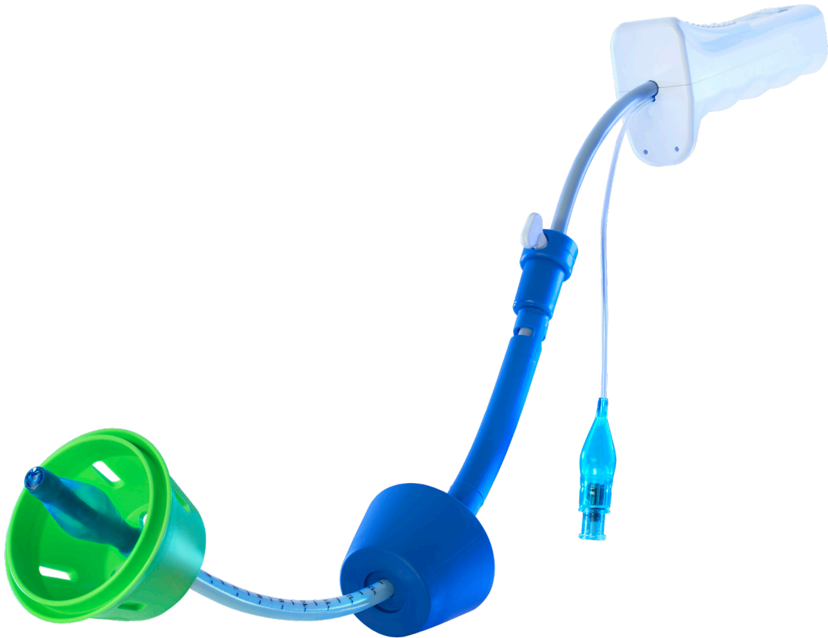
AIRSEAL ® ACCESS MANAGEMENT SYSTEM

VCare ® Plus helps surgeons deliver clear control of the anatomy using effective uterine manipulation while assisting with the identification of key surgical landmarks for a safe, efficient, and repeatable procedure.