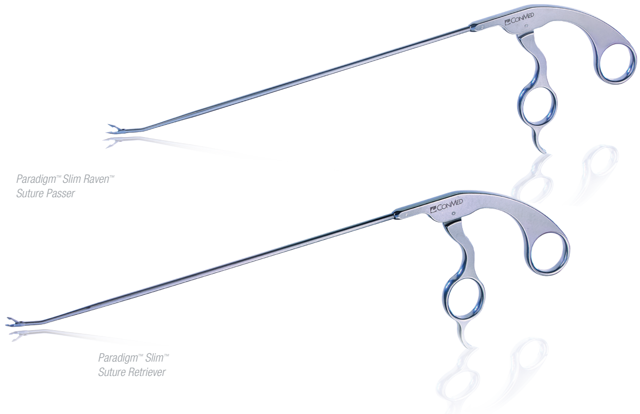
Paradigm™ Slim Raven™ Suture Passer