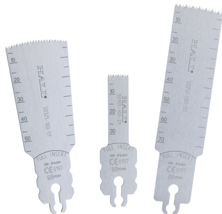
Offset Stryker Replacement Blades