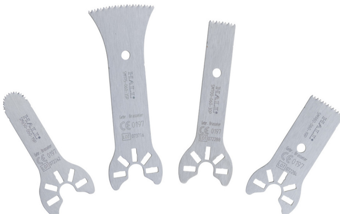
Small Bone Stryker Replacement Blades