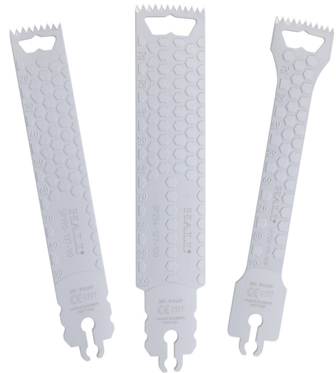
Premium Stryker Replacement Blades