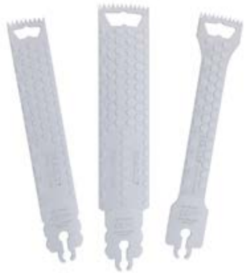
Premium Stryker Replacement Blades