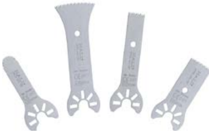
Small Bone Stryker Replacement Blades