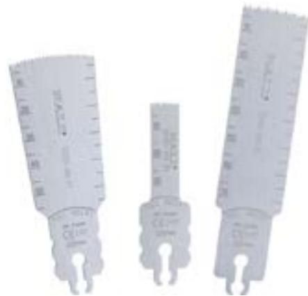
Offset Stryker Replacement Blades