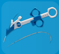
COMPLETECONTROL ™ Sphincterotome