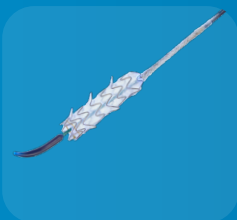
GORE ® VIABIL ® Short Wire Biliary Endoprosthesis