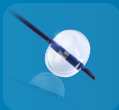
FIT ® Biliary Stone Balloon

To learn more, call 1-866-4CONMED (Toll Free) 727-214-3000 (International) or visit www.CONMED.com .