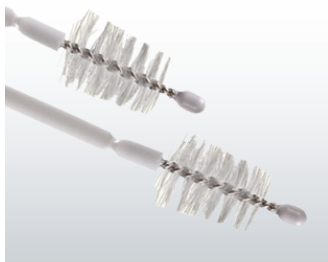
Rounded Brush Tip

Our Channel Master™ series of disposable endoscope cleaning brushes feature a custom crimped shaft designed to effectively traverse tight channel bends and deflect through 90° valve port transitions. To help ensure proper cleaning of the valves, button and biopsy channels, CONMED offers a combination brush featuring a larger head of soft bristles with a convenient "No Slip" handle at one end and channel brush at the other. While the dual ended brush utilizes two brushes with one catheter pass.