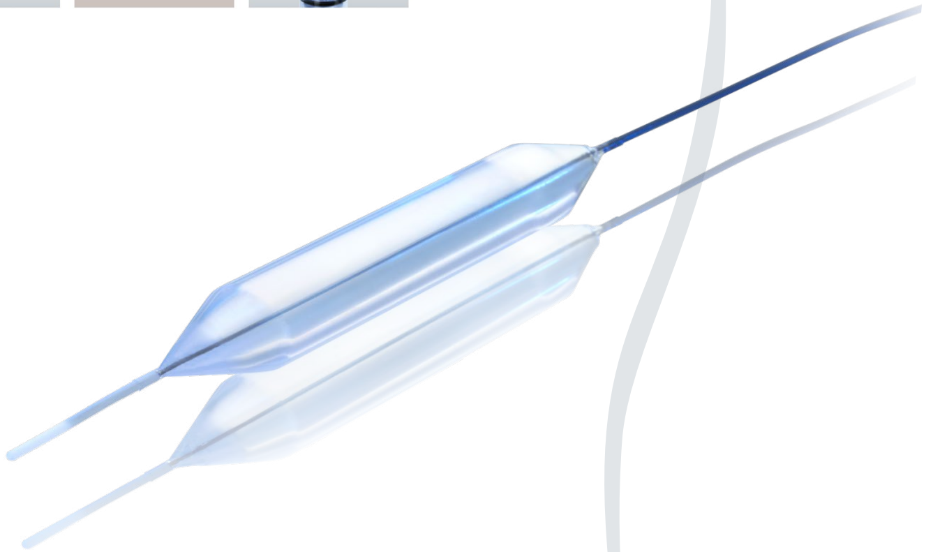
GORE ® VIABIL ® SHORT WIRE BILIARY ENDOPROSTHESIS