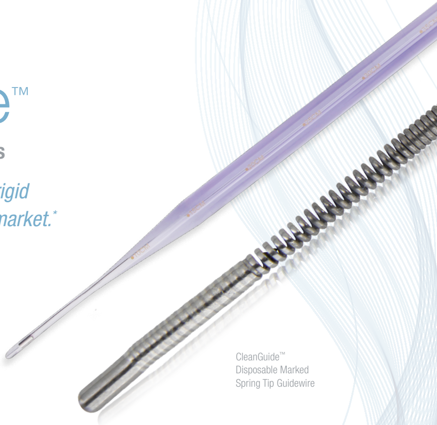
CleanGuide™ Disposable Marked Spring Tip Guidewire

The only sterile-packed , disposable, rigid esophageal dilation system in the US market.*