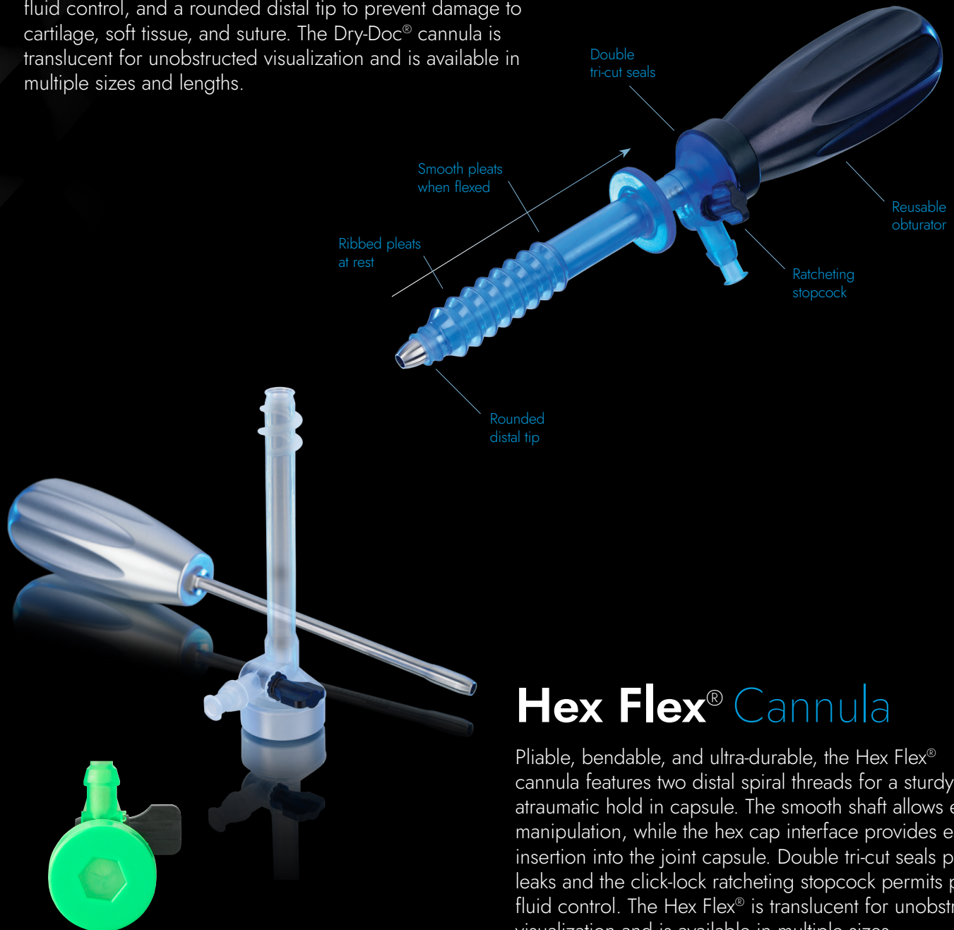
Hex Interface with Obturator

The Dry-Doc ® cannula is an all-in-one smooth and ribbed cannula that provides a robust hold in skin, muscle, and capsule. It has double tri-cut seals, a click-lock ratcheting stopcock for precise fluid control, and a rounded distal tip to prevent damage to cartilage, soft tissue, and suture. The Dry-Doc ® cannula is translucent for unobstructed visualization and is available in multiple sizes and lengths.