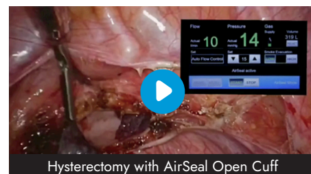
Hysterectomy with AirSeal Open Cuff

AirSeal® ensures a stable pneumoperitoneum and continuous smoke evacuation, allowing you to operate at low pressure. Gynecologists experience uninterrupted visibility even with an open vaginal cuff during colpotomy.