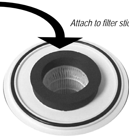
Attach to filter sticky side down