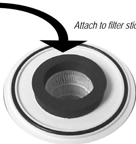
Attach to filter sticky side down