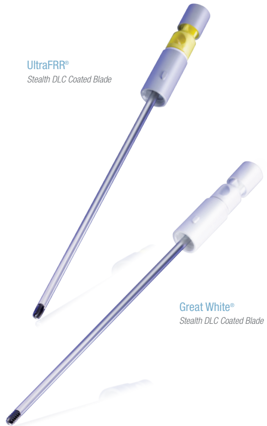
Great White® Stealth DLC Coated Blade