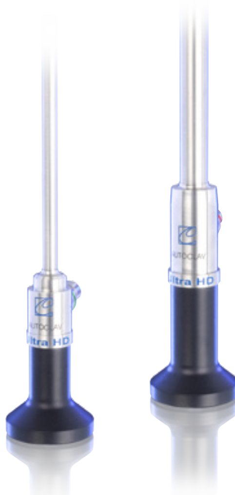
Ultra High Definition Laparoscope

To schedule an evaluation, contact your local CONMED Sales Representative.