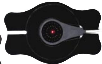
Back-view with Sensor PRO-H