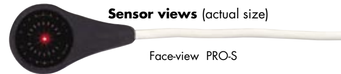
Sensor views (actual size)

Dimensions 4.75" x 11" x 10" (12cm x 28cm x 26cm) Voltage Input 100 to 240 VAC at 50 to 60 Hz Max AC Power 40VA consumption Battery Sealed lead-acid for about 2 hours of use