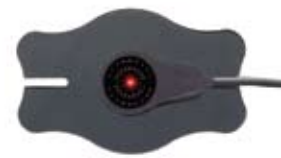
Back-view with Sensor in PRO-HA/HG