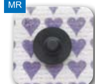
Softface® Small RTL