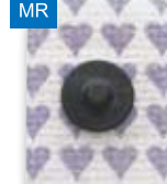
Softface® Medium RTL