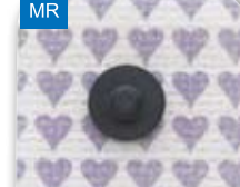
Softface® Large RTL