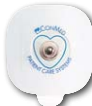
Cleartrace™ 2 LT