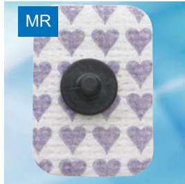
Softrace® Medium RTL