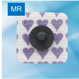
Softrace® Small RTL