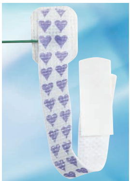
Softrace® Limb Band