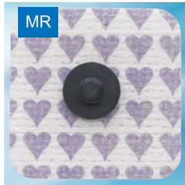
Softrace® Large RTL