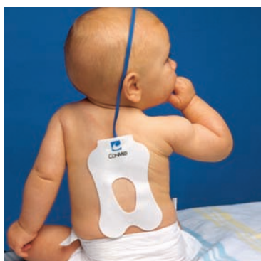
Infant ECG Backpad