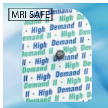
High Demand® II