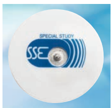
Special Studies Electrode