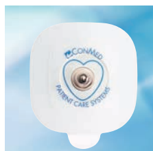
Cleartrace® 2 LT