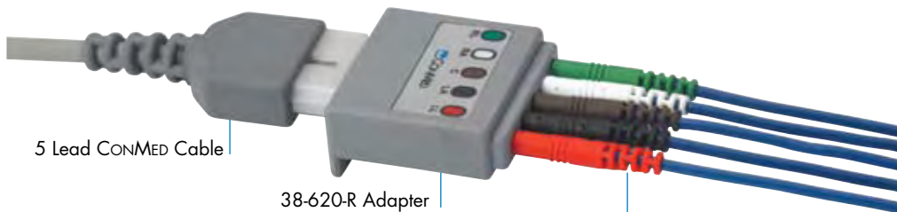
5 Lead CONMED Cable