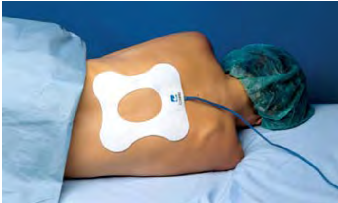
Adult Backpad 01-3130