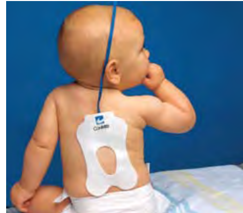
Infant Backpad 01-4130