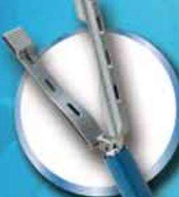
5mm Babcock Grasper