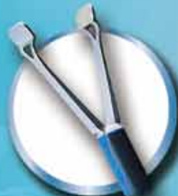
10mm Babcock Grasper