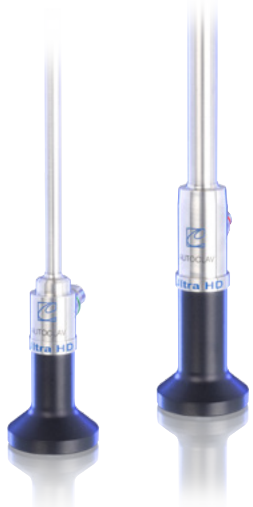
Ultra High Definition Laparoscope

To schedule an evaluation, contact your local CONMED Sales Representative.