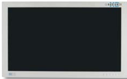
HIGH DEFINITION Monitors