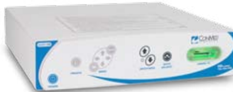
IM4000 High Definition Camera